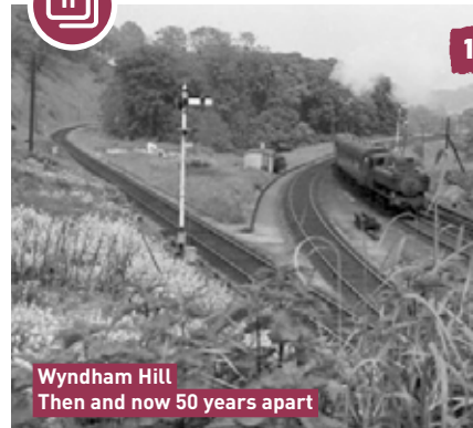
Wyndham Hill Then and now 50 years apart