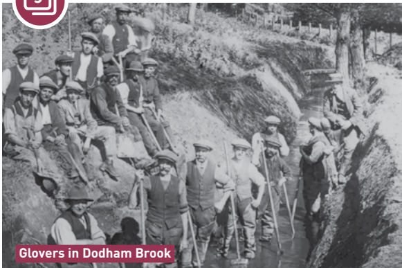
Glovers in Dodham Brook