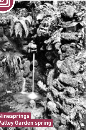
Ninesprings Valley Garden spring