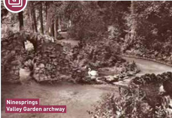
Ninesprings Valley Garden archway